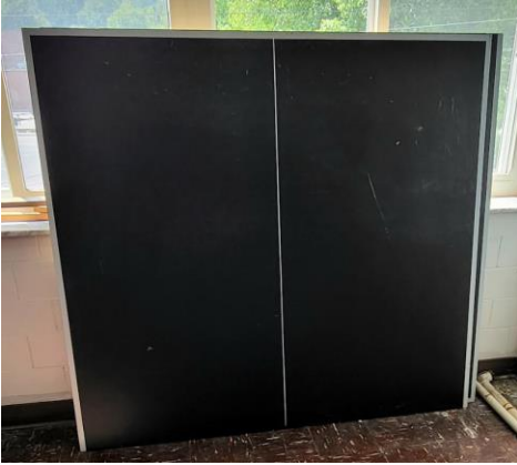
Ping-Pong Table Boards (no frame)