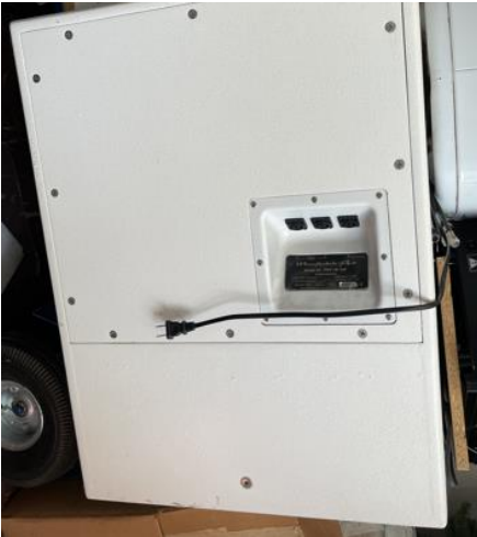
Wharfedale Pro Sub-woofer