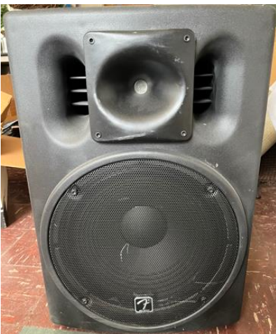
Fender Ace-15 Speaker