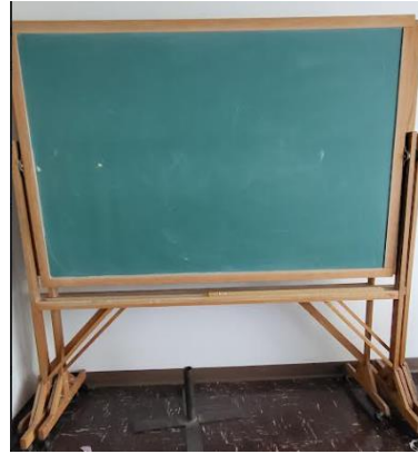
Two Chalk Boards