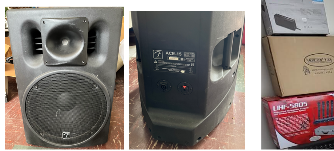
Fender Ace-15 Speaker