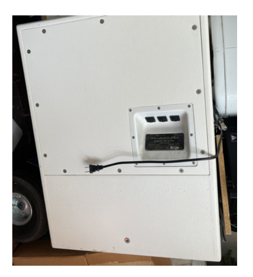
Wharfedale Pro Sub-woofer