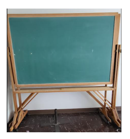
Two Chalk Boards