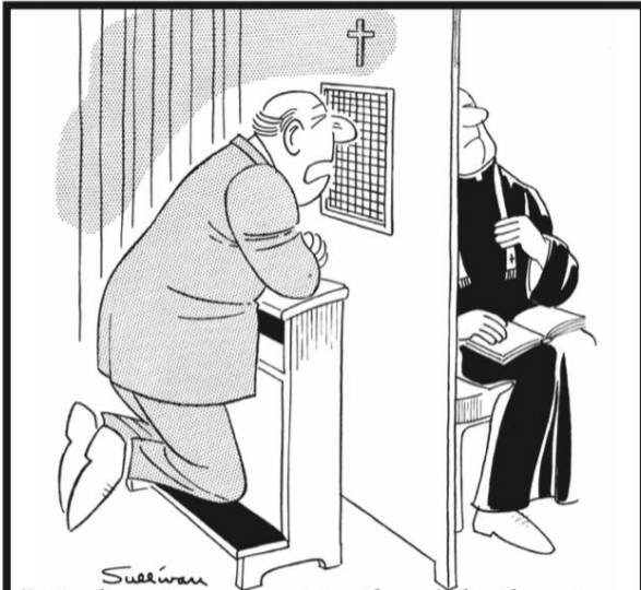
"My heart goes out to the sick, the poor, the underprivileged, the lonely, and those who have a different color, nationality, or background than my own. But my mother-in-law drives me up the wall."