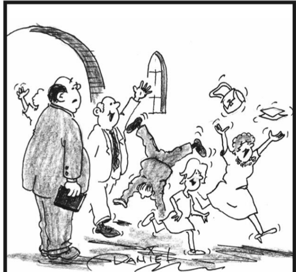
"Following another long, tiresome sermon, the folks of Oakwood Church reaffirm the Doctrine of the Resurrection."