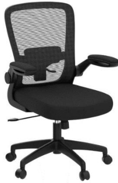
Assembly of an office chair.