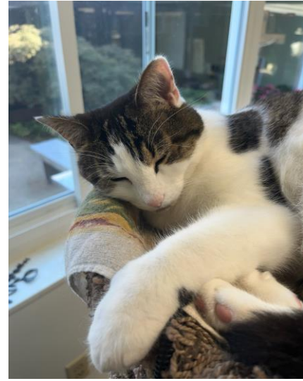
Walter dreams of summer.

An experience touches us to the depths of our souls, and in that moment we are graced with a vision— if only fleetingly— of the flawless wholeness and perfection of it all. Then the heart fills and flows over, even amid the brokenness of this world. — Alan Morinis