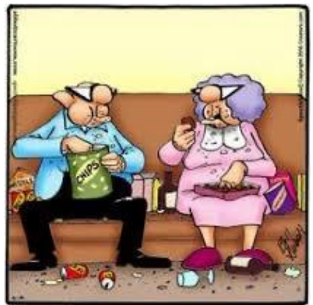
"Hurry! Our New Year's resolutions start in ten minutes."