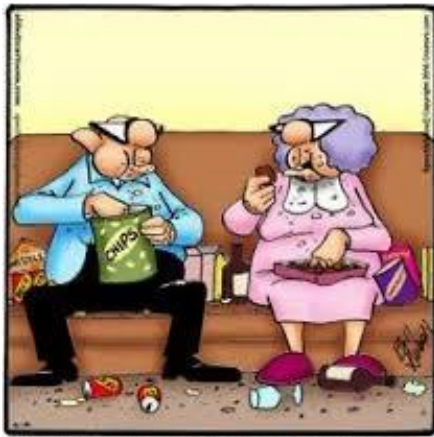
"Hurry! Our New Year's resolutions start in ten minutes."