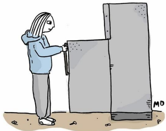
Looking in the fridge over and over and expecting different results is the definition of insanity.