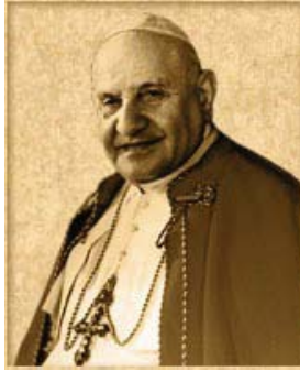
For St. Angelo Guiseppe Roncalli